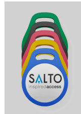
Key Fob NXP MIFARE®