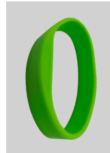
Silicone Wristband NXP MIFARE®