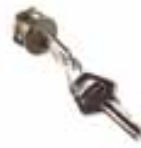
CM-B Pawl with two metal release keys.