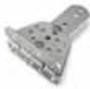
PLA14 Screw-adjustable rear bracket. Pc/Pack. 2