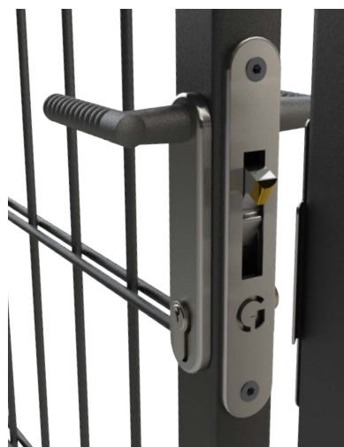
ML4 FC (Full Cover) with ornamental handles