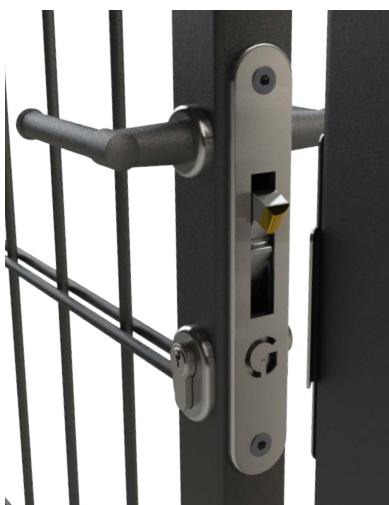
ML4 DC (Dual Cover) with plain handles